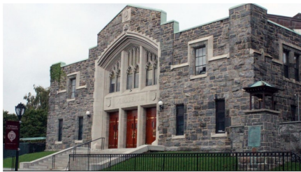
Historic Rose Hill Gym at Fordham University

Plan to attend Celebration of Basketball Event Saturday, November 19 Fordham University click here for tickets and more information